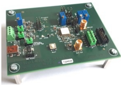
Figure 2: Demo board for keyword spotting with the test chip by TU Dresden (white, center)

The processing element with the MINRES RISC-V core and the SpiNNedge accelerator performs real-time keyword spotting in 34 uW, achieving a classification accuracy on the widely-used Google speech command dataset of over 95%, which outperforms most of the existing low-power hardware solutions for this use case. A demo board has been implemented to showcase the solution.